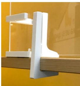
C. Optional edge adapters