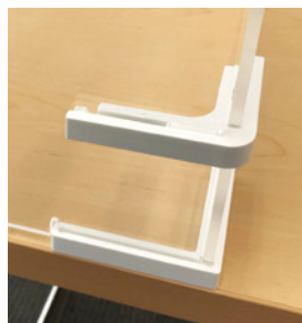
D. Secure, durable connectors