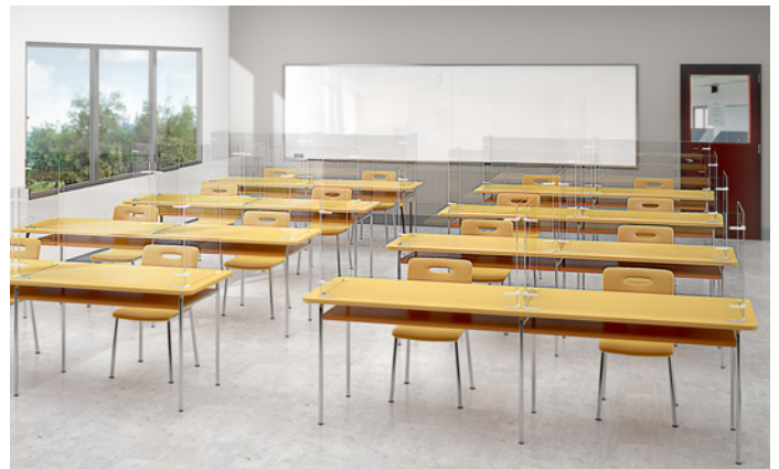
Individual screens provide protection for shared desking.

International Building Code Fire Test Requirements Adjoin uses materials that exceed all applicable fire test requirements listed in Section 2606 - Light Transmitting Plastics, Sub-Section 2606.4 of the International Building Code.