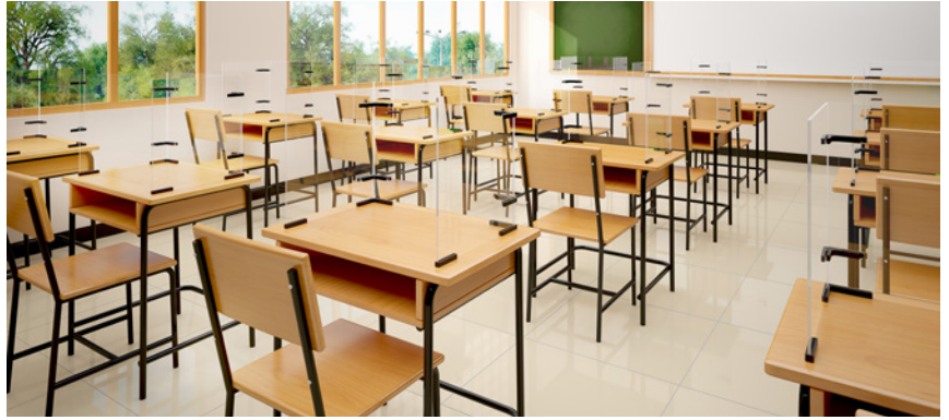
Screens sized to fit individual desks.