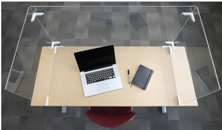
3-sided shield provides protected work space for any scenario.