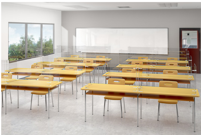
Individual screens provide protection for shared desking.