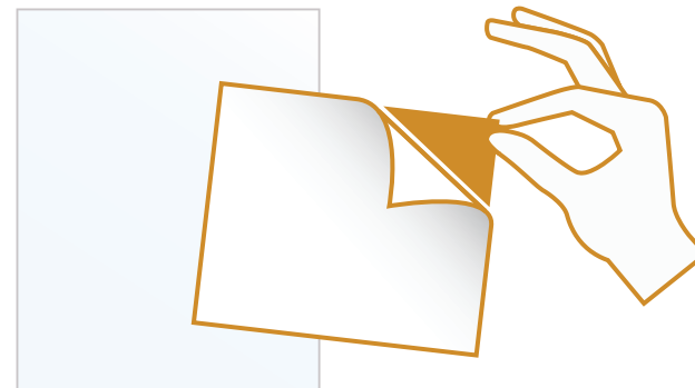
Install & Transparency Diagram

Defy wallcovering transforms walls into dry erase boards.